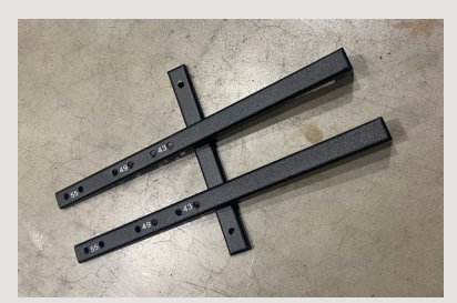
1 x Security Frame Arms