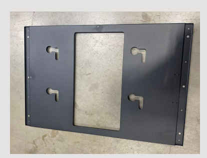
1 x Wall Mount